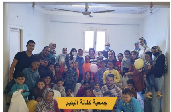
URL: Pharos University Celebrated Orphans Day | Pharos University in Alexandria (pua.edu.eg)