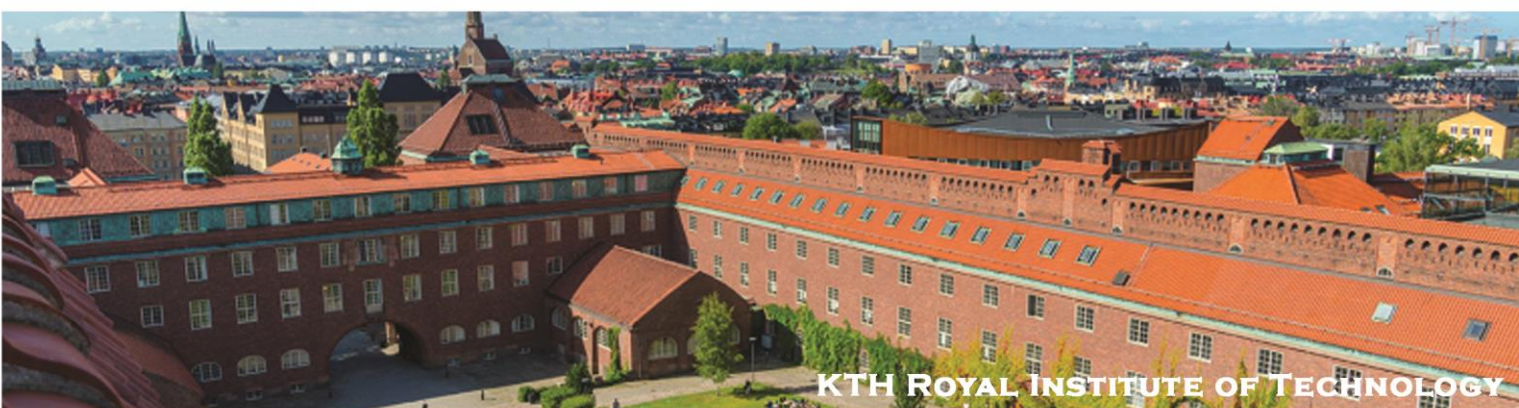
KTH ROYAL INSTITUTE OF TECHNOLOGY

https://www.pua.edu.eg/faculty-of-engineering/icntse-2021/