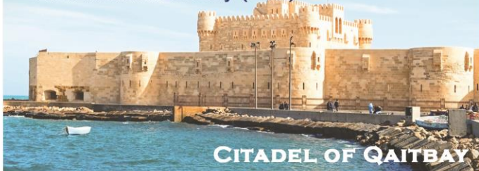
CITADEL OF QAITBAY