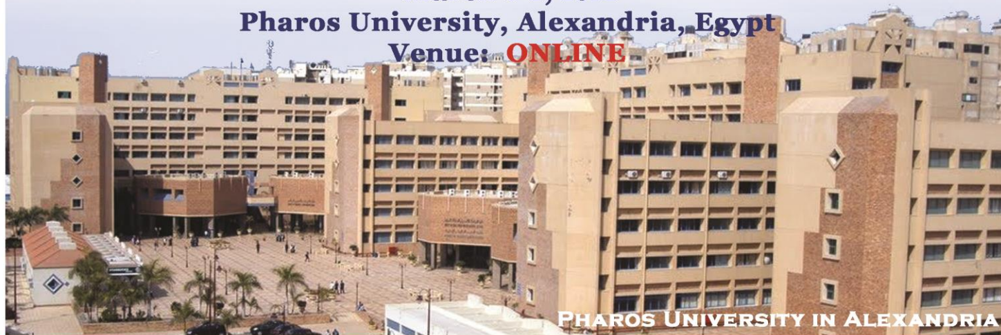
PHAROS UNIVERSITY IN ALEXANDRIA

Pharos University in Alexandria , established in 2006, is the first non-governmental university in Alexandria. It has 11 colleges accredited by the Ministry of Higher Education. It is a member of the Association of Arab Universities, the Euro-Mediterranean Universities Union and the Francophone Universities Agency. The colleges cover wide spectrum of specialties among them is engineering.