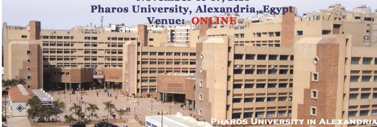
PHAROS UNIVERSITY IN ALEXANDRIA

Pharos University in Alexandria , established in 2006, is the first non-governmental university in Alexandria. It has 11 colleges accredited by the Ministry of Higher Education. It is a member of the Association of Arab Universities, the Euro-Mediterranean Universities Union and the Francophone Universities Agency. The colleges cover wide spectrum of specialties among them is engineering.