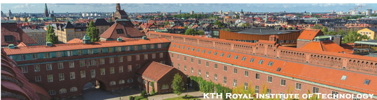
KTH ROYAL INSTITUTE OF TECHNOLOGY

https://www.pua.edu.eg/faculty-of-engineering/icntse-2021/